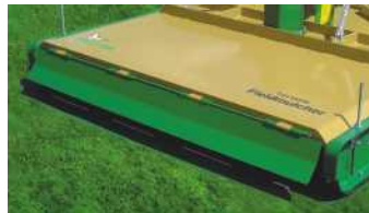
Safety Flaps - Fieldmulcher™

The topmast, which connects to the tractor top-link, is mounted on bushes and connected to the rear of the machine by HT chains. This flexible linkage allows the rotary cutter to follow the ground contours.