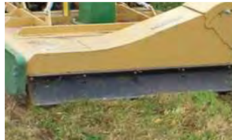
Safety Flaps - Side Discharge Mulcher