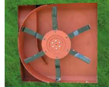
Cutting Assembly Side Discharge Mulcher