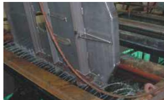
5 Stage Cleaning Process