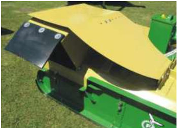
Side Discharge Chute

The Falcon Side Discharge Mulcher comes with a chute cover so that the branches slide gently over the cover instead of hitting the chute directly, thereby eliminating branch damage. The cover can be removed if preferred. There is also a chute offset feature which allows the chute to be set back by 100mm making the machine narrower and therefore allowing it to cut in narrow orchards or vineyard rows without causing damage to the crops. The chute is adjustable so that it can be set to discharge material at the required distance.