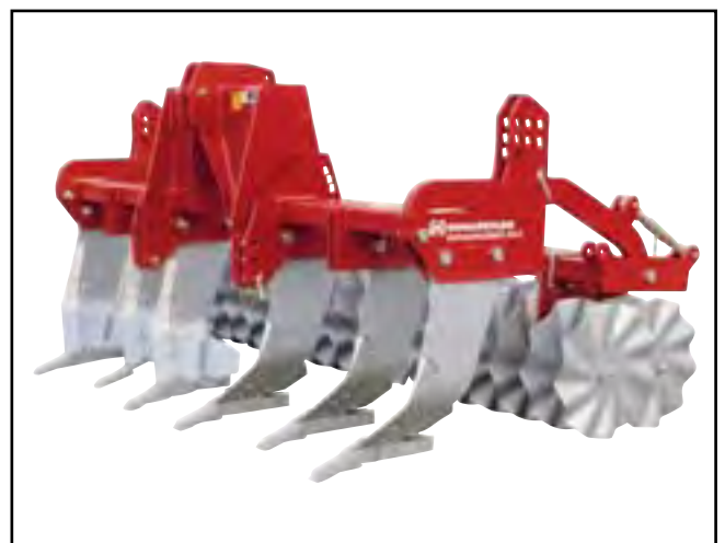
Kongskilde Paragrubber ECO 300 with Cutter roller